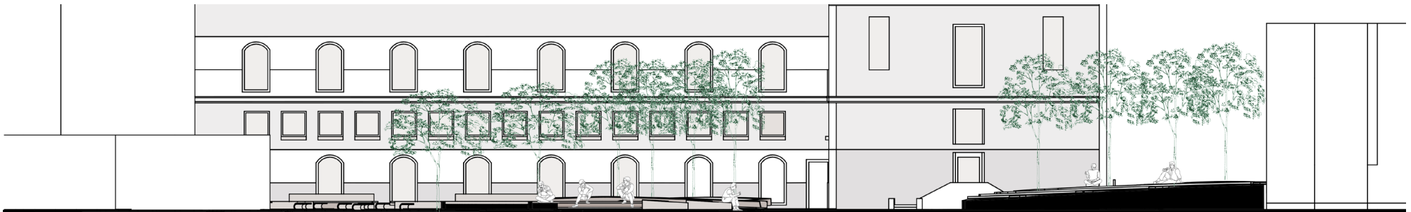
• Section A-A'