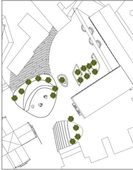
• Before remodeling