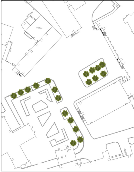
• Before remodeling

When the pedestrian flow passes by, the passageway is preserved, and with the design concept, it is roughly divided into three areas according to the pedestrian flow and the location of trees, creating a flow speed and creating a vibrant campus.