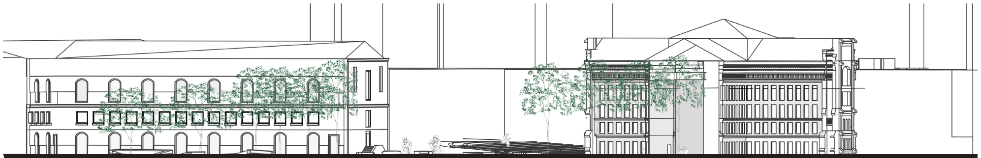
• Section B-B'